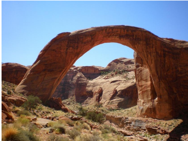
Rainbow Bridge, Glen Canyon National Recreation Area, Utah